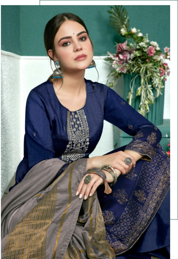
Be exclusive, Be Devine, Be yourself.