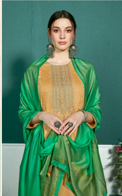
Fashion world is a unique one, and I love being part of it! I find it fascinating.