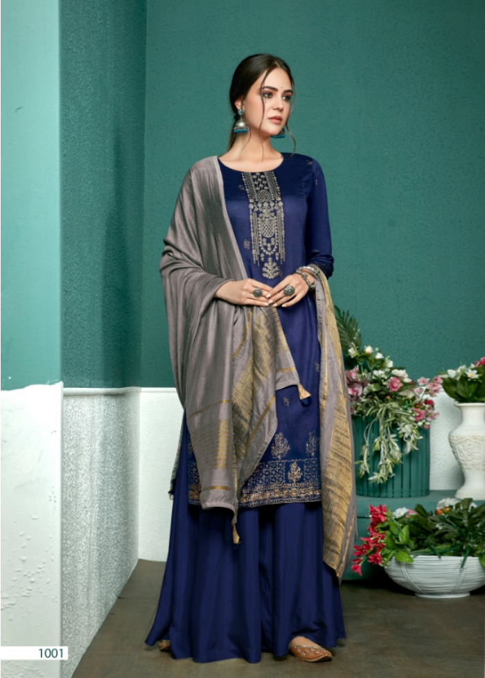
Luxury, For the Woman Who Deserves It