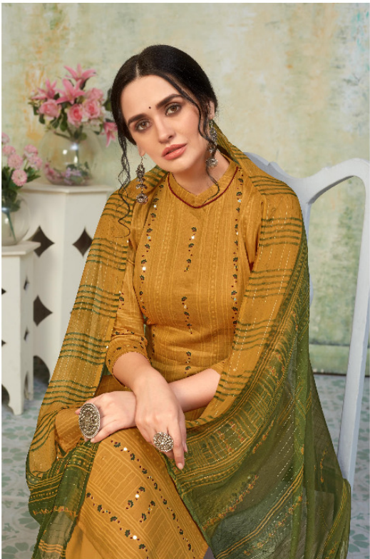
Embroidery and thread work which has added a real charm to women clothed in this collection. | 698 005