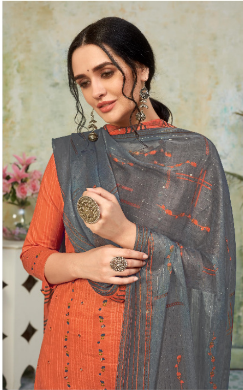
Experience the exotic floral bliss in soft hues and embroidered floral design. | 698 008