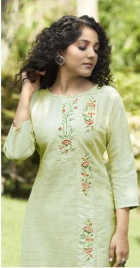
The design were beautiful & we could see a few outfit that we could wear up with other every day.