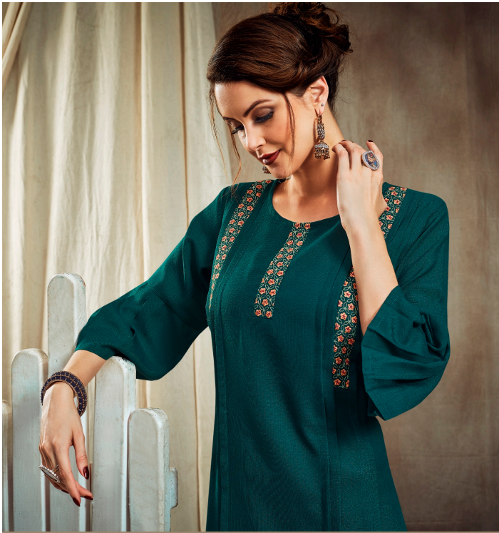
A breath taking array of fine detailing & intricate design inspired by Indian culture. 2021