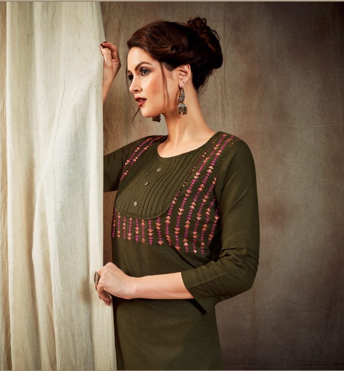
A scintillating plethora of timeless masterpieces inspired by beauty from Indian culture. 2020