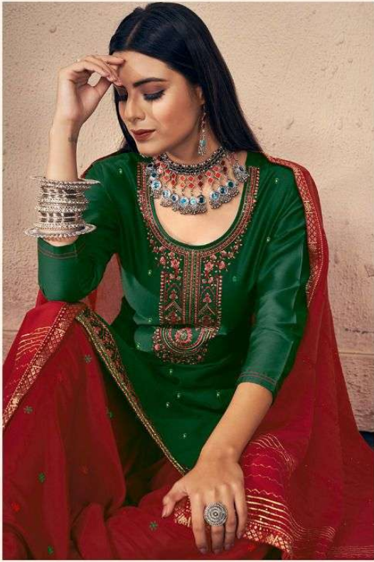
The key is to contrast two elements so you don't end up over doing the feminine quotient