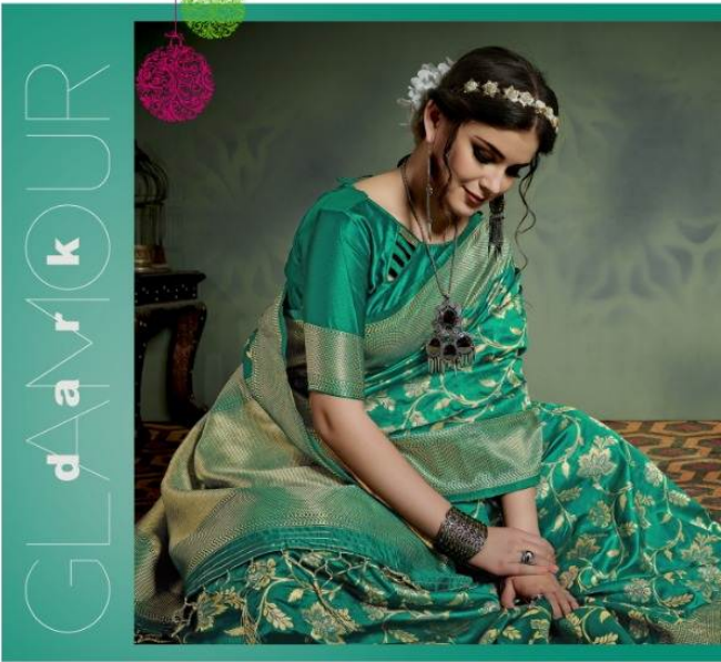
Collection is reminiscent of the era gone by. It present tracing green to the traditional court clothing depicting the true image of the rich modern culture