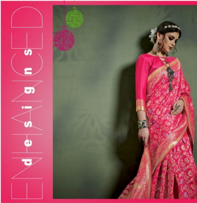
Sarees is REFLECTION of indian culture and spiritual essence. One on the edge when Indian thought is Glamour