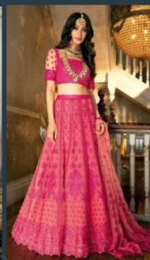
Design Number 3005