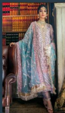
Design Number 3004