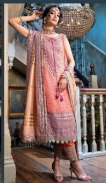
Design Number 3003