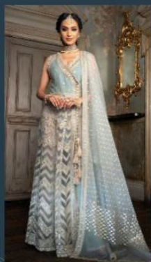
Design Number 3001