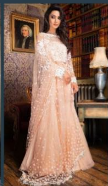
Design Number 3002