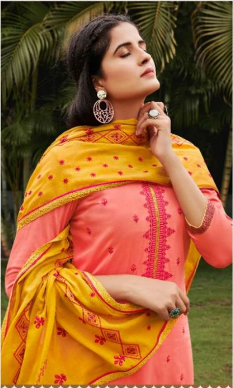
The collection was a perfect blend of Indian silhouettes & contemporary style.